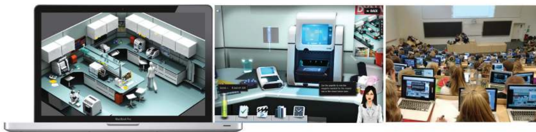
Figure 1 Screenshots from the gamified laboratory simulation tested in this study (Labster, http://www.labster.com/biolabs/ ) (left, center). Students used the simulations from regular computers at home (in the case of testing at Stanford University Online High School) or in class (right).

We also conducted a study on 57 students from four Danish high schools. Forty-four percent of the students agreed or completely agreed with the statement, “I consider pursuing an education within biotechnology or other biological subject to a greater extent, after having used the gamified laboratory simulator.” This indicates that gamified laboratory simulations may provide a powerful case for initiatives to increase students' engagement and motivation for further studies and careers within biotech. Large-scale longitudinal studies measuring the actual study and career choices of students exposed to gamified laboratory simulations compared with a control group would be valuable to guide future decisions.